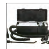
HEPA vacuum system